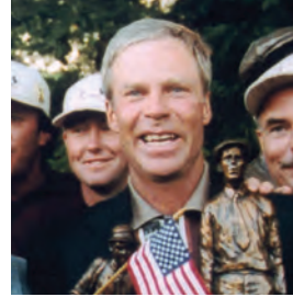
BEN CRENSHAW 1999