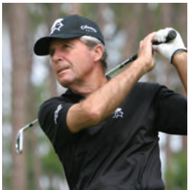
GARY PLAYER 2008