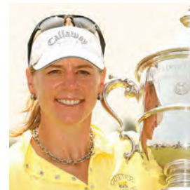
ANNIKA SORENSTAM 2010