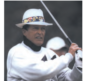
CHI CHI RODRIGUEZ 2003