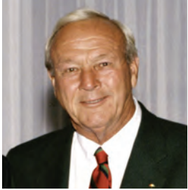
ARNOLD PALMER 1997