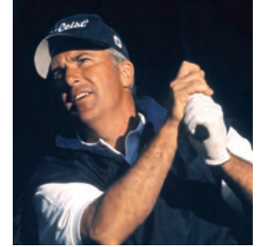
CURTIS STRANGE 2000