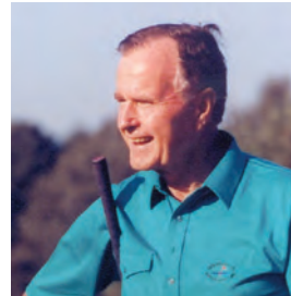
PRESIDENT GEORGE H.W. BUSH 2002