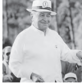
GENE SARAZEN 1998