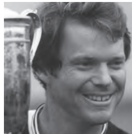
TOM WATSON 2009