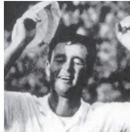
KEN VENTURI 2001