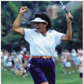
NANCY LOPEZ 2004